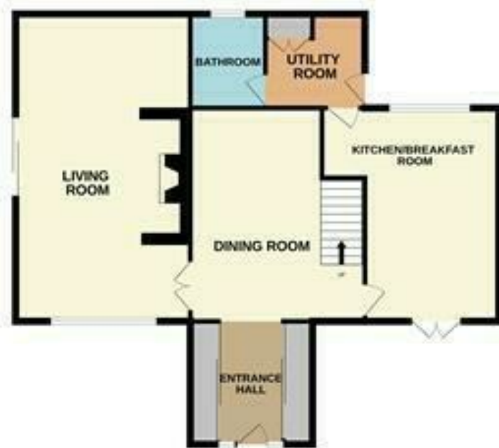
GROUND FLOOR 975 sq.ft. (90.6 sq.m.) approx.